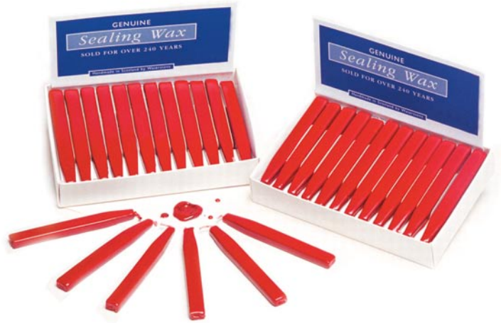
Additional boxes of sealing wax are available for general use with rings or desk seals.