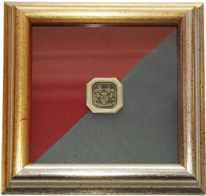
Have your wax impression framed in silver and grey or gold and red